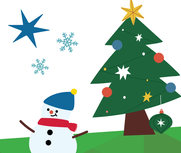
See more gift ideas here: yaa.org.uk/product/product-category/ christmas-shop