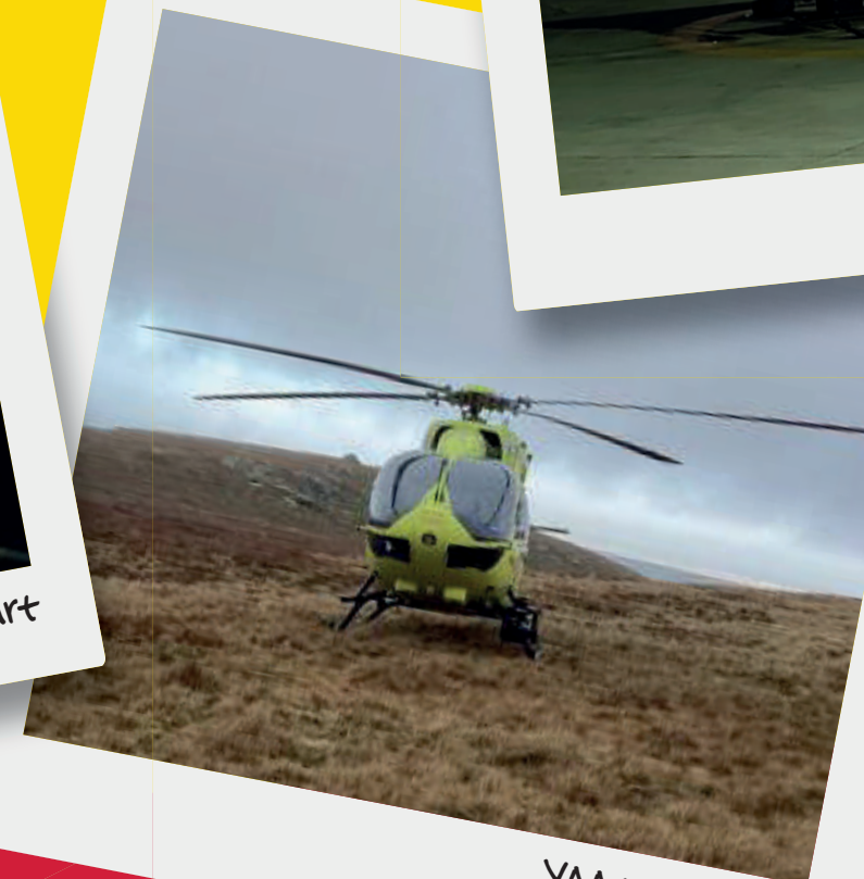
YAA Duty Crew