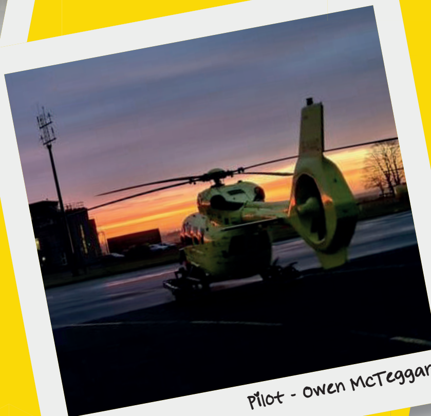
Pilot - Owen McTeggart