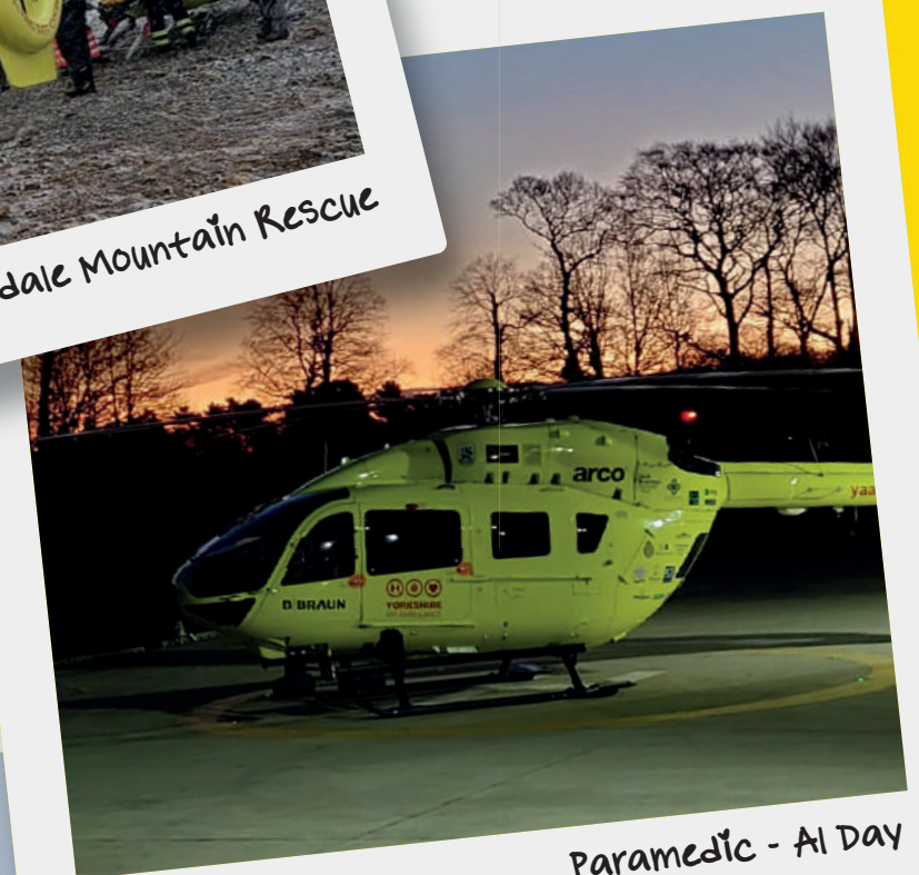
Paramedic - Al Day