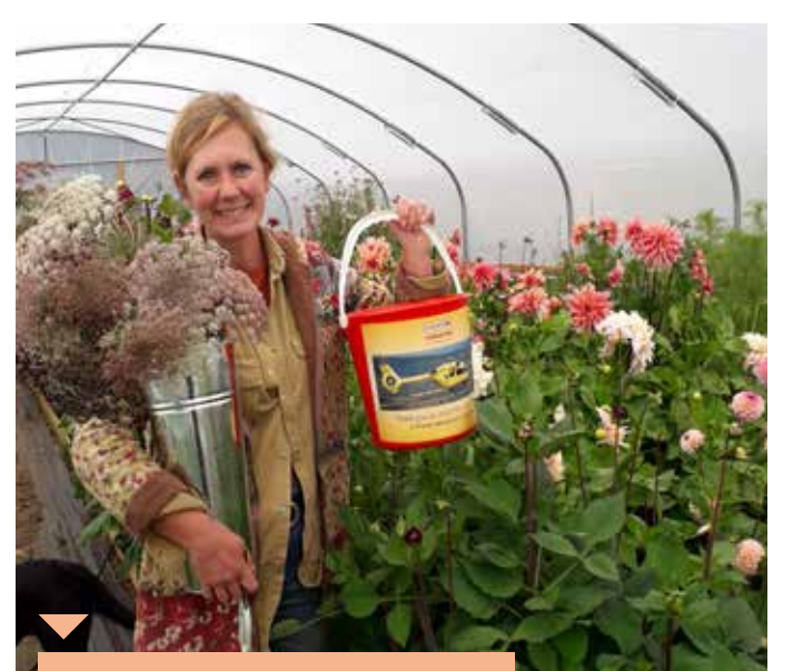
Thank you to Victoria at The Secret Garden in Ripon for raising over £100 from a flower stall on VE Day!