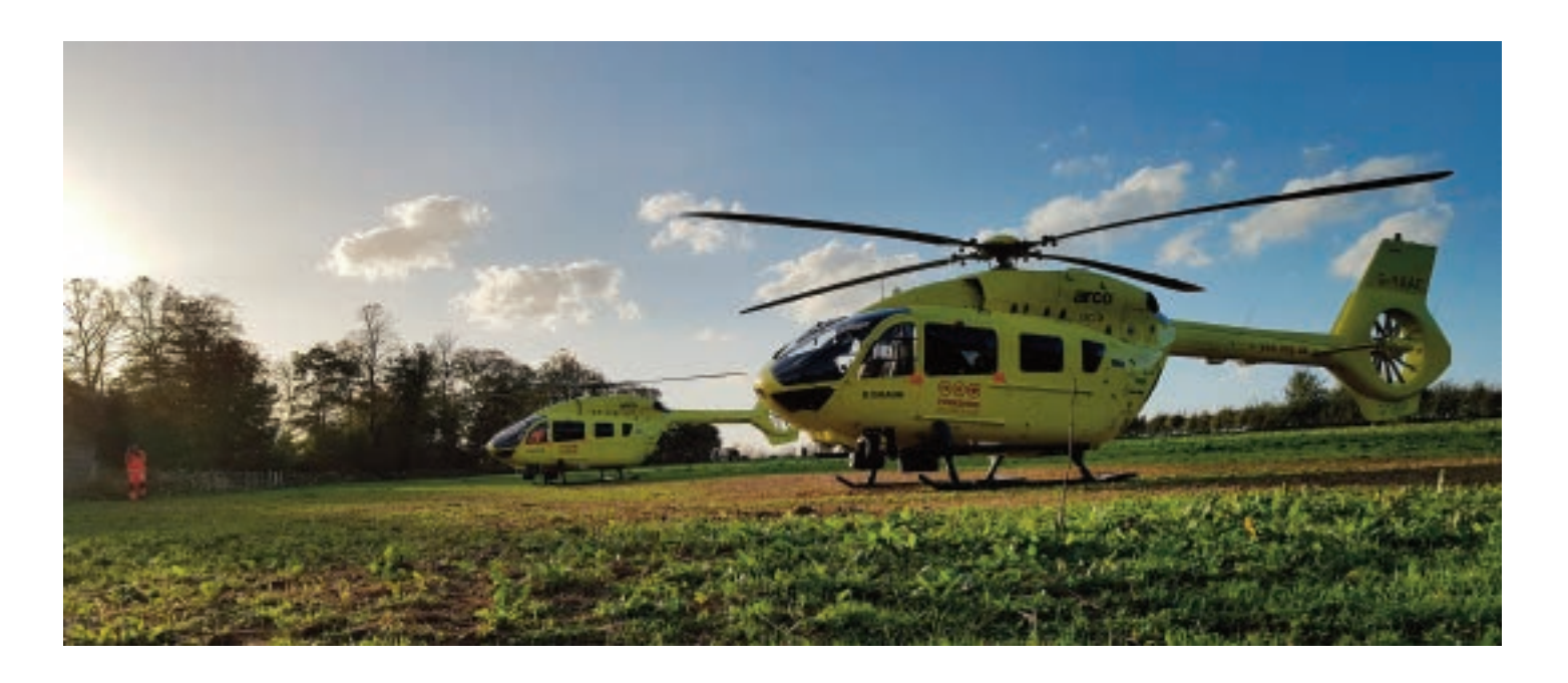
Join the YAA Social Media Family! Just search Yorkshire Air Ambulance!